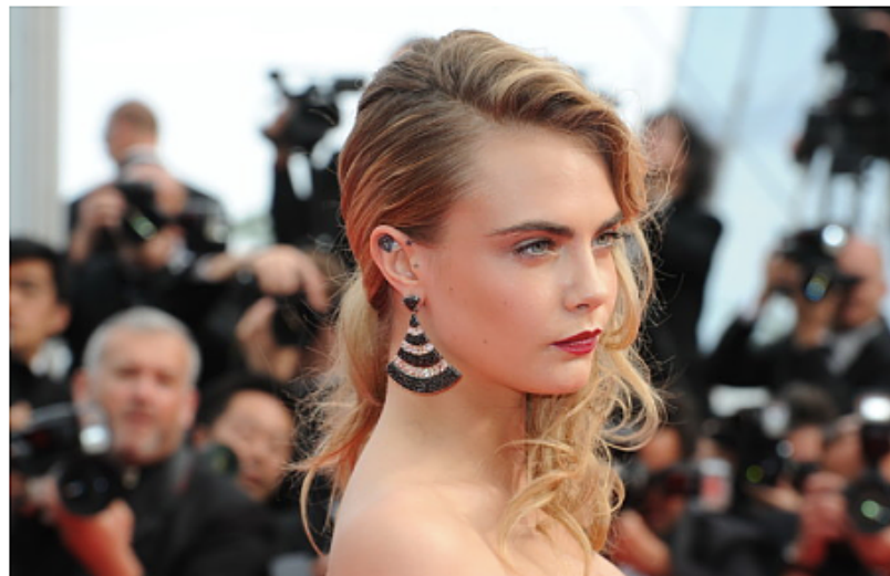
Last year, Cara Delevingne wore de Grisogono white-gold earrings set with black and white diamonds.

Bikinis, bow ties and big diamonds set the tone from the start, although there also were candid moments, as in 1956, when a tight-lipped and